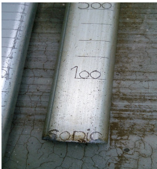
Name of calibration agency